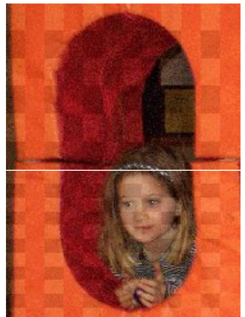
Lots of Cool Play Things!