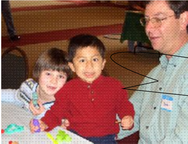
More Play Doh Fun!